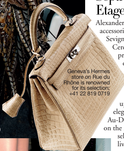
Geneva's Hermes store on Rue du Rhône is renowned for its selection; +41 22 819 0719

and fashion shows. Septieme.com ; +41 22 310 77 70